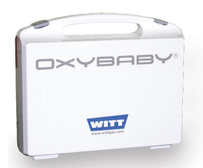
Please note our variety of accessories on the following pages