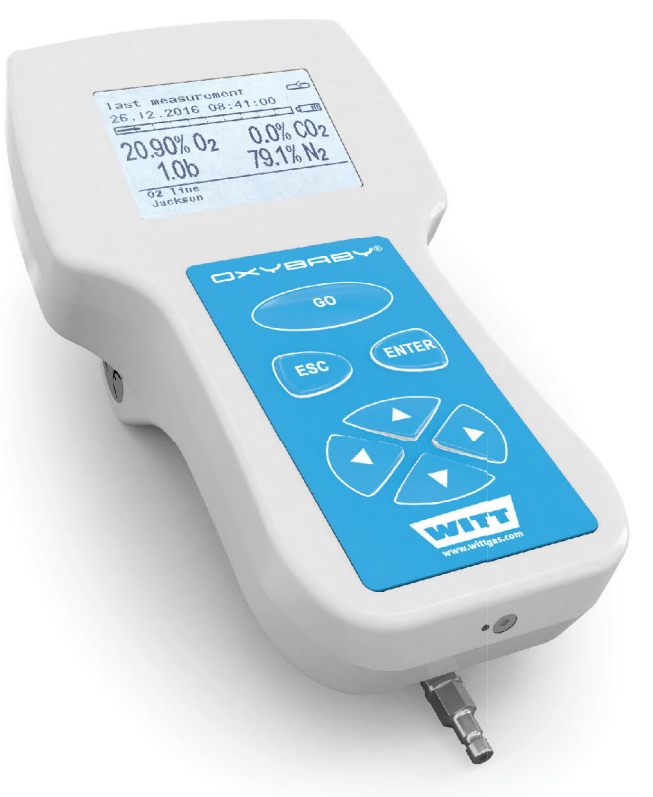
further information on www.oxybaby.com